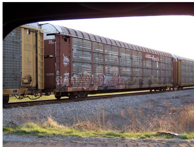
This is the latest addition to the Division 8 Pie Card. This new section will be for train spotting done around the Nation. If you are interested in participating in this new section, read the submission guidelines on page C4. We are looking forward to everybody's pictures and stories behind the pictures. Oh yeh, this will also count towards your authors award.