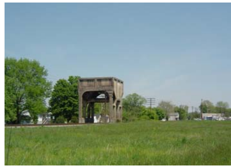
Charlie Keeling provided the correct answer for last month's location. The railroad location was Lebanon Junction.