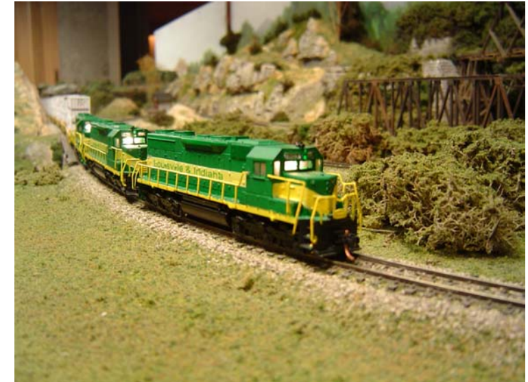
An LIRC (Louisville & Indiana) train speeds through New Albany. How can that be? The photo was taken on the KSONS module layout when it was set up at the New Albany-Floyd County library