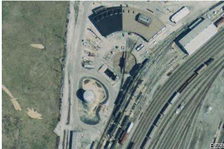
This month we are looking from a different perspective. Identify either the railroad that built the roundhouse, or the railroad that owns it. Win a prize if your correct entry is drawn at the May meeting.