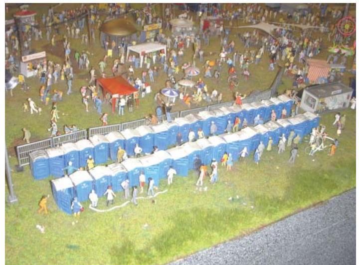
Crowds abound and nothing (above right) is omitted.