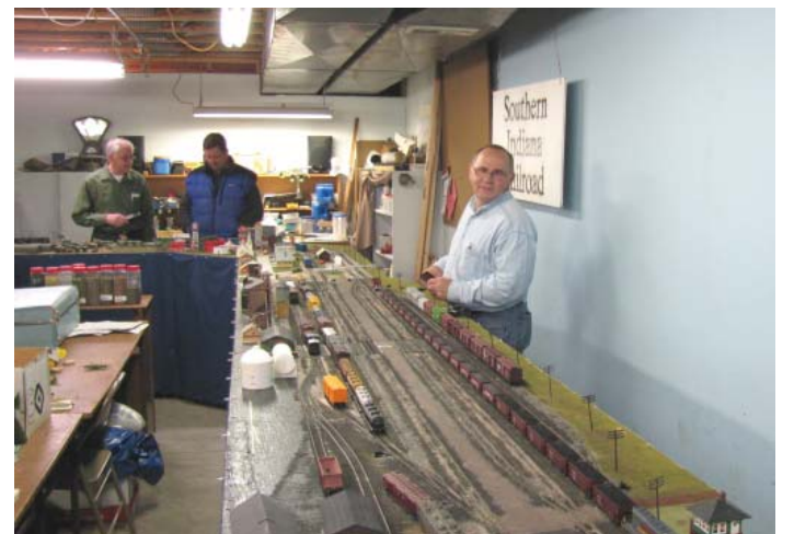
This month features the Southern Indiana Railroad Club layout. The club meets at the First Presbyterian Church, Walnut and Chesnut Streets in Jeffersonville, IN. They meet on the second Thursday of the month at 7:00 p.m.