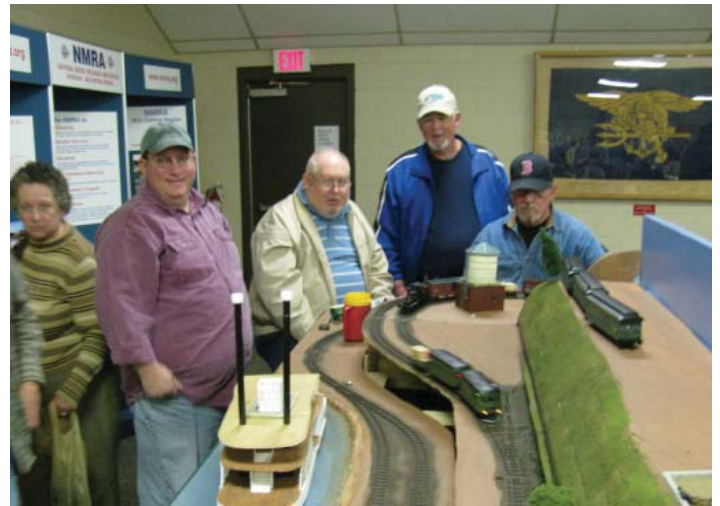
Above left: TT train layout at the show. Above right: Radcliff Model Railroad Club operating their On30 layout.