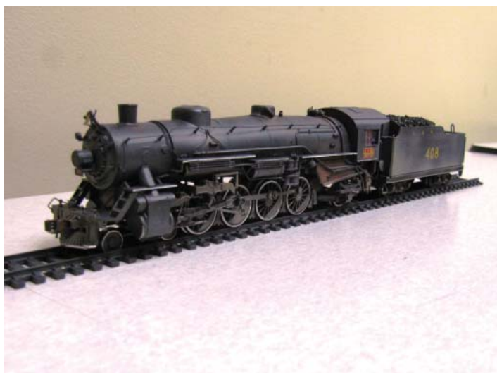
Model Contest Winner Tom Lundquist's Model