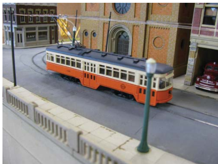
An HO portable layout modeling the Cincinnati Street Car System. Cincinnati required the use of two poles, one for current pick up, the other for return in the downtown area. This was one of the layouts set up at the Division 7 show last month.