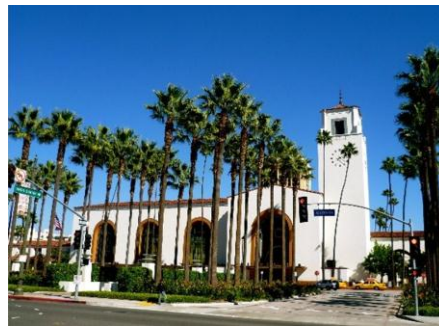
Above. Charlie Keeling is show with the model he has just built of the Los Angeles Union Passenger Terminal (LAUPT). It is a Walthers Kit. The photo of the prototype mission-inspired station is from Yahoo Images.