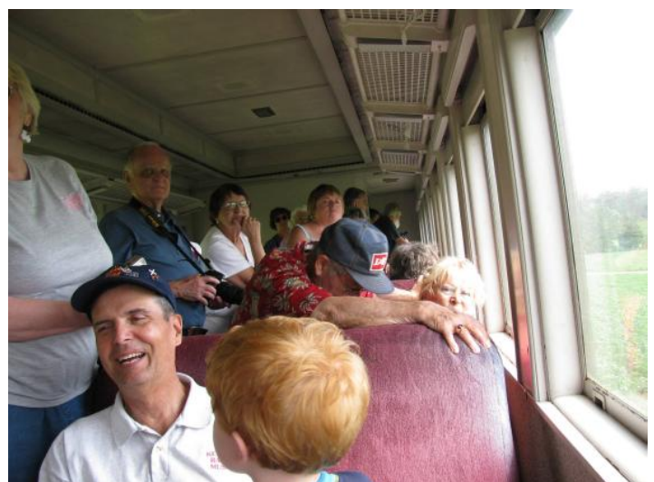
Above left: Shop tour. Above right: train ride.

For more pictures, check the Division 8 web site: http://div8-mcr-nmra.org .