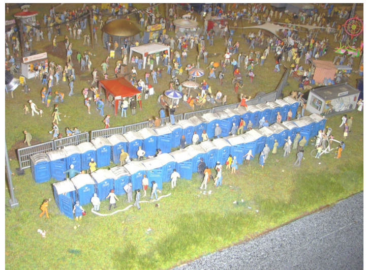
Crowds abound and nothing (above right) is omitted.