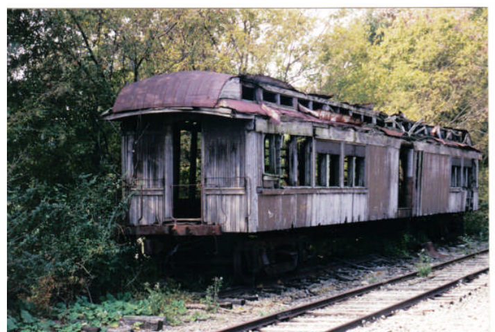
Friends of the L & N Depot (Bowling Green) are planning on restoring the former L & N Jim Crow Combine that has been on a siding in Glasgow, KY since 1955. It will be taken to Bowling Green for restoration. When completed it will go on display at the Historic Rail Park and Museum in Bowling Green, KY.