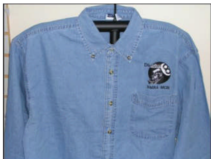
Long Sleeve Denim Shirt