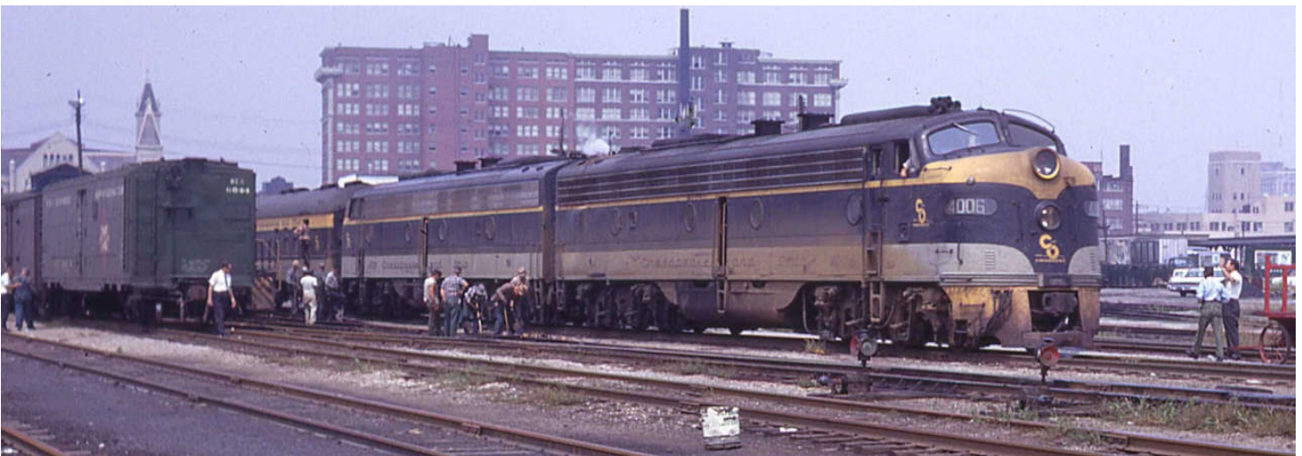
Louisville section of C & O's George Washington preparing to depart Union Station for Lexington and points east, 1967.