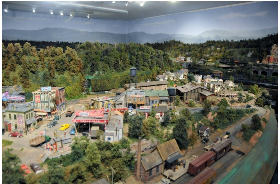
Right: Eric provided us with a distance shot on Bob Lawson's Southern Railway Layout. This picture captures only a small portion of Bob's fine layout.