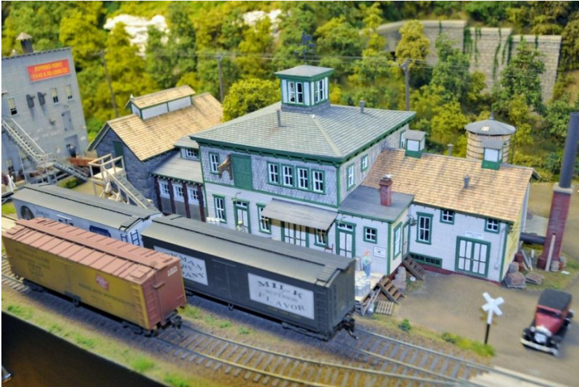
Left. A creamery on Ed's layout.