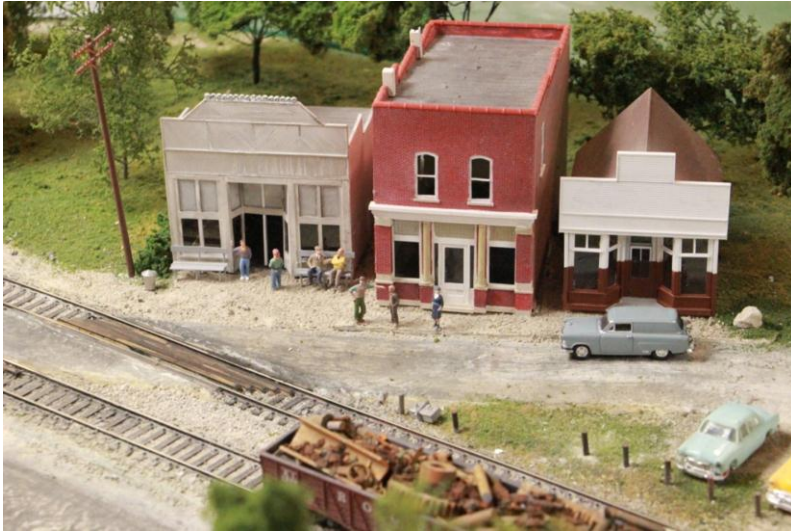
Left. Campbellsburg, IN. One of the towns modeled on the Depot layout.