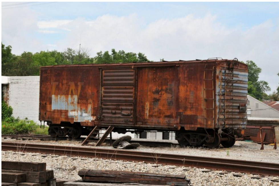
Left. Gone but not forgotten. You can still make out the L & N logo on this box car set out on a siding at Salem, IN. The car has been sitting there for several years, used for storage. The fate of CSX's old Monon route through Salem is questionable.