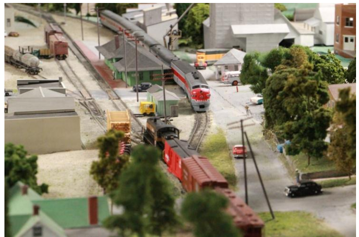
Left. The Southbound Thoroughbred is stopped at the depot at Salem, while a northbound freight passes.