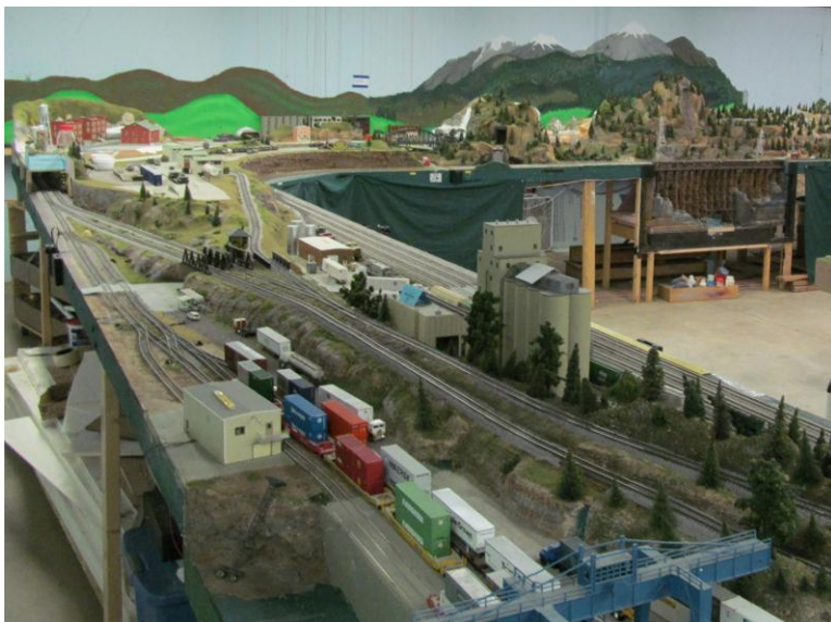
There are numerous opportunities for switching, including this inter-modal facility.