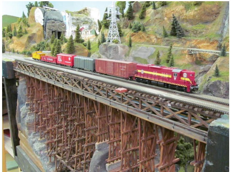
A Duluth, Missabe & Iron Range freight crosses a scratch-built trestle.

This month's meeting is at the club house of the Radcliff Model Railroad Association. The Radcliff Model Railroad Association traces its roots to November 1984 when it was first organized as the Gold Vault Model Railroad Club. Meetings were held in a borrowed classroom on Fort Knox Army base located next to Radcliff, KY. Later they moved to Knox Blvd. where they were for many years. Today they are located at 1375 N. Wilson Rd. in Radcliff. There are three layouts: HO (the largest), On30, and N-scale under construction.