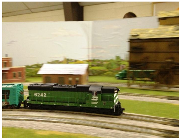
At speed on the K & I Club Layout