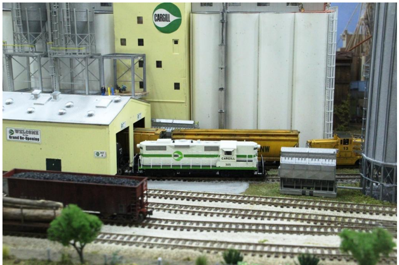
Miami Valley Modular Club layout at the Louisville Great Train Expo. last month.