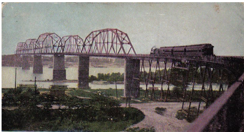
NYC train crossing the bridge in 1907.

The railroad bridge approaches on both side of the river were taken down circa 1969. See Kentucky-side picture below from 1967 by Charlie Keeling.