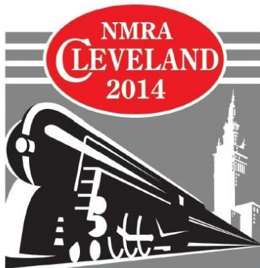
The 2014 National Convention will be in Cleveland.