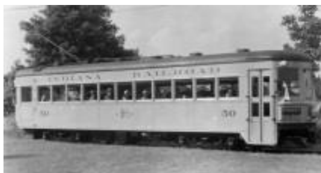
Above, #50 between Louisville and Indianapolis in 1931.