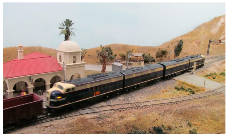
Santa Fe was an early buyer of GM freight diesels -- here is a quartet of EMD FT's, delivered before or during WWII. Each B unit was semipermanently attached to its A (no coupler), thus the smaller gap.