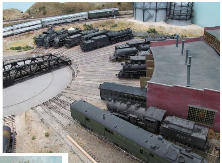
Left. A busy railroad requires a lot of motive power. Note the typical Santa Fe turntable with trusses rising above track level.

Rick models the Santa Fe of the 1950's in the mountains of Southern California ; Alco PA and PB units in Santa Fe's famous passenger scheme (red/yellow/silver) are leading across the trestle.