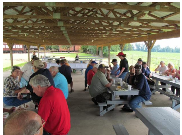
Above: Enjoying a meal and fellowship at the Picnic.