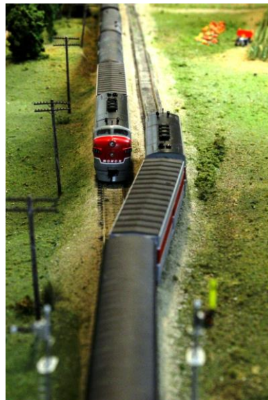
Left: Trains 5 and 6, the north- and southbound editions of the Thoroughbred , pass each other at a siding north of Salem on the Salem depot layout.