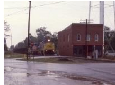
Left: Campbellsburg, IN on the Salem Depot Museum HO Railroad . The layout tries to depict actual scenes along the Monon in and near Salem. Compare this scene with a prototype picture taken in 2002 at the actual location. Unfortunately by that time the passing siding and most of the buildings modeled were gone.