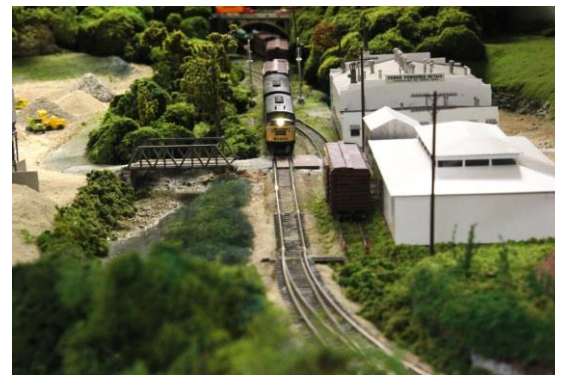
Above: A Louisville bound freight crosses Quarry/Market Street roads; soon it will be passing the depot in Salem.