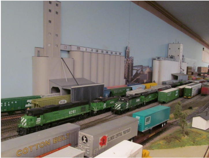
EAST TOUR continued