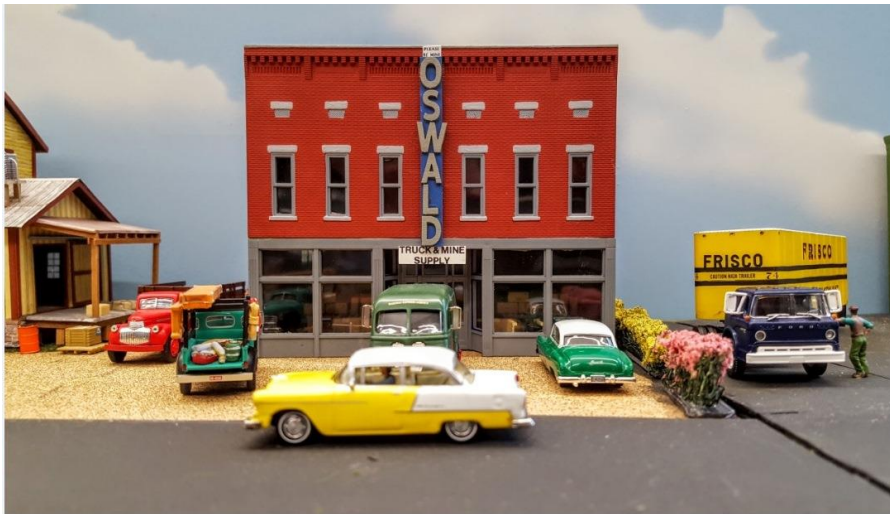
Above. The Main Street row.