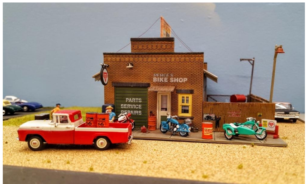
Right: Deuce's Bike Shop.