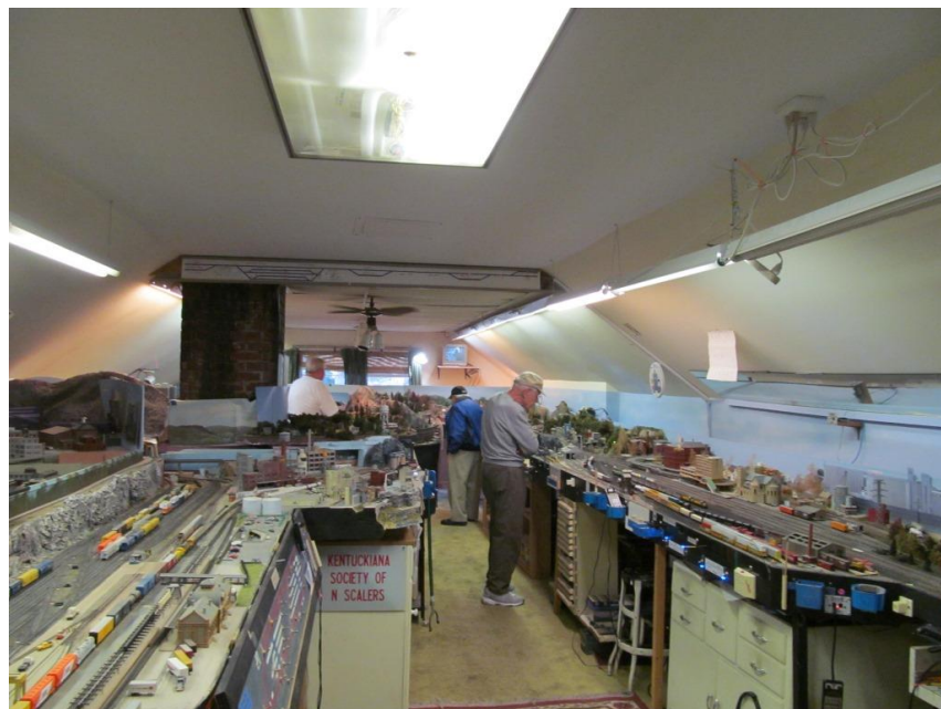
Left: An over view of Rick's layout room. Photos taken during the October Division Layout Tour.