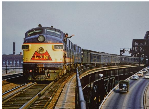
NYC and L&N express and mail trains.