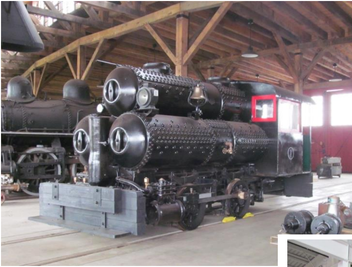
<< #1 compressed-air 0-4-0.

The Friday Convention Tour was to the Age of Steam Roundhouse in Sugarcreek, OH. This is a private working facility owned by the Jerry and Laura Jacobson Foundation. It is not open to the public, but occasionally hosts tour groups.