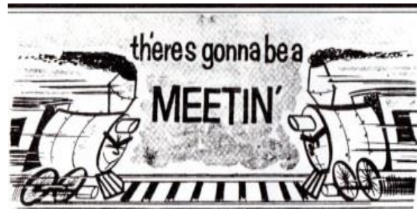
NO MEETING IN JULY-PICNIC INSTEAD