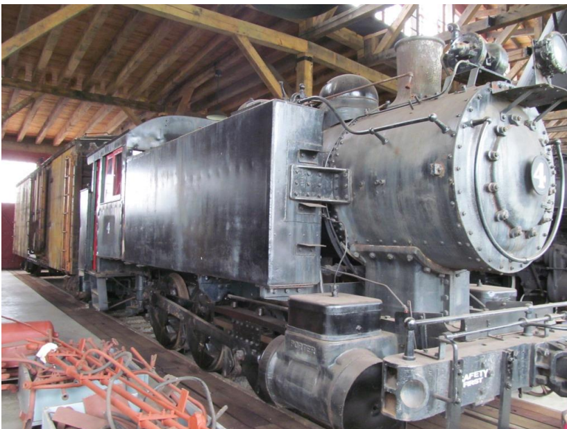
<< U.S. Navy 0-6-0T #4

Built for the U.S. Navy South Brooklyn Section in 1919 by the H. K. Porter Company. It was purchased by the Brooklyn Eastern District Terminal Railroad in 1922. It operated with the BEDT as #13 until 1963 when the railroad was dieselized. It sat for years in Strasburg, PA and was acquired by the Age of Steam in 2011.