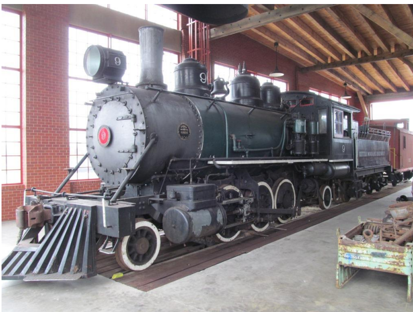
<< McCloud River 2-6-2 #9

It was built by the Baldwin Locomotive Works for the McCloud River, operating in the forests of Northern California. Originally built to burn wood, it was converted to coal in 1920. Retired by the McCloud River in 1934, rebuilt in 1937, and went to the Yreka Western RR. Going through several owners over the years it eventually pulled tourists on the Kettle Moraine Rwy. in North Freedom, WI. It was purchased for the Age of Steam Roundhouse in 2015.