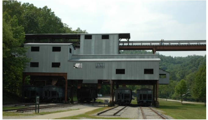
Above: Reserved Blue Heron coal tippie on the Big South Fork Scenic Railway in Stearns, Kentucky

So as you can see, a lot of elements go into initial layout planning. In my case, the first step is what scale, what railroad and time frame, what geographic region of the country and how much area you have to model. These are all basic considerations but for me were the beginning of where to start. These are quickly followed by what I really want the model railroad to do? Is this a purely point-to-point railroad that will be operated by a group of individuals for hours on end? Will it have staging? How much can I fit into a general area that I have available in my house or above my garage, or as some folks I know, in the barn? Available space is a limiting factor.