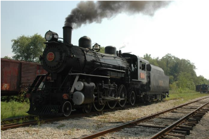
Above: L&N K-2A at Kentucky Railway Museum, New Haven KY

By Eric Waggoner