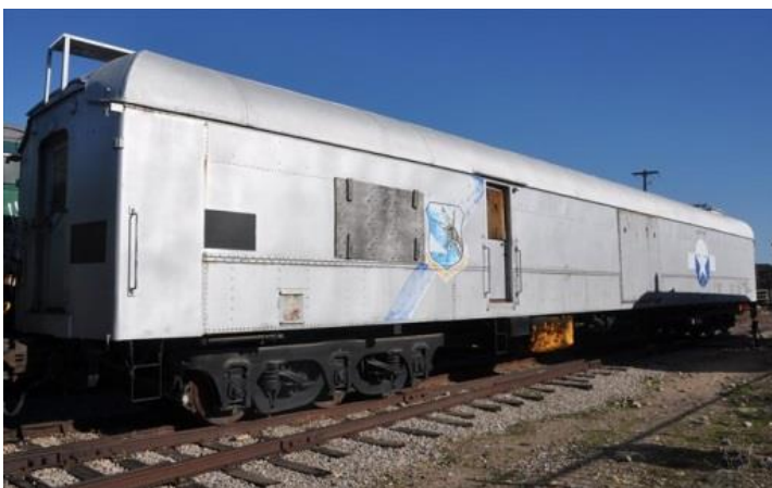
Left: B52 Bomber Support Car

They are interesting and unusual railcars. What a great combination: railroading and flying together in one package! I hope to build a bomber set in HO in the future.