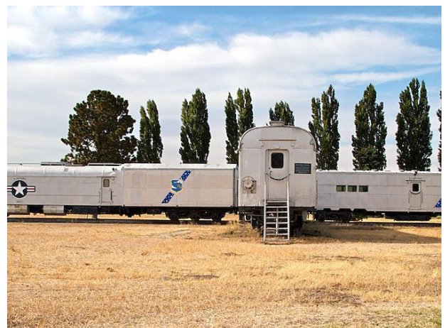
Right: Preserved SAC Simulator Cars (one bomber set, one tanker set)