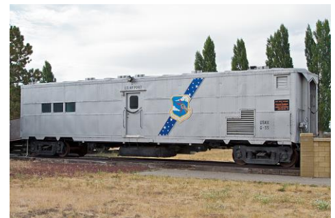
Right: KC-135 Aerial Refueling Tanker Support Car (Former Army Troop Kitchen Car)

At the end of the Cold War in the early 1990's, and as the B-1 bomber came on line, the Air Force significantly reduced the B-52 aircraft in its inventory. As a result, the requirement for mobile CPTs was also reduced. State-of-the-art simulators were also coming on-line, and the Air Force purchased several of these. At that time aircrews were