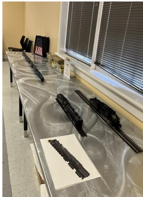
Above: Show and Tell Table at the meeting.