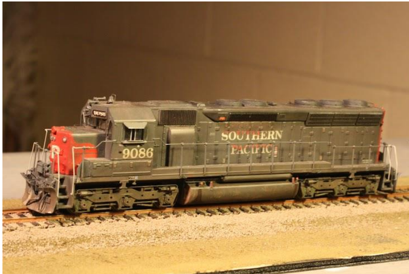
Left: Steve Lasher's HO "SP's Finest."

SP 9086 is a Rail Power Products shell and frame with many upgrades, including a new cab and nose. It received a Details Associates SP light package along with many other parts to bring it up to SP standards. Steve custom bent the handrails from 0.015" piano wire for sturdiness. The chassis is a RPP frame with Athearn trucks. Drive line components are powered by a Mashima motor. It was finished with Floquil colors, Microscale decals, and weathered with chalks and powders