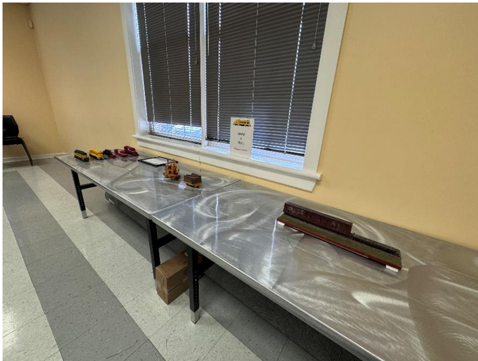
Left: The February “Show and Tell” only had models from three members.

We have many modelers in Division Eight, so why not display your work? Display means just that...display. Display models are neither judged nor voted on. They are merely for the enjoyment and benefit of our members. I believe our members enjoy seeing models at meetings (I certainly do), and there is always something to be learned when seeing someone else’s work and discussing it with them. Let’s put the ‘model’ back into model railroading, and, as someone told me many years ago, don’t just belong...participate!