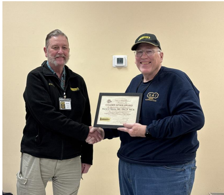
PHOTO FROM THE MEETING