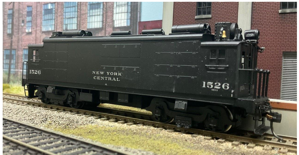
Right: Russ Weis' HO "Tri-powered Box Cab."

SP 9086 is a Rail Power Products shell and frame with many upgrades, including a new cab and nose. It received a Details Associates SP light package along with many other parts to bring it up to SP standards. Steve custom bent the handrails from 0.015" piano wire for sturdiness. The chassis is a RPP frame with Athearn trucks. Drive line components are powered by a Mashima motor. It was finished with Floquil colors, Microscale decals, and weathered with chalks and powders