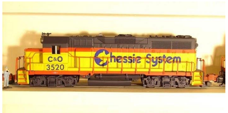
Right: Randy Griggs' S-Scale "ERTL GP35 Locomotive Conversion."